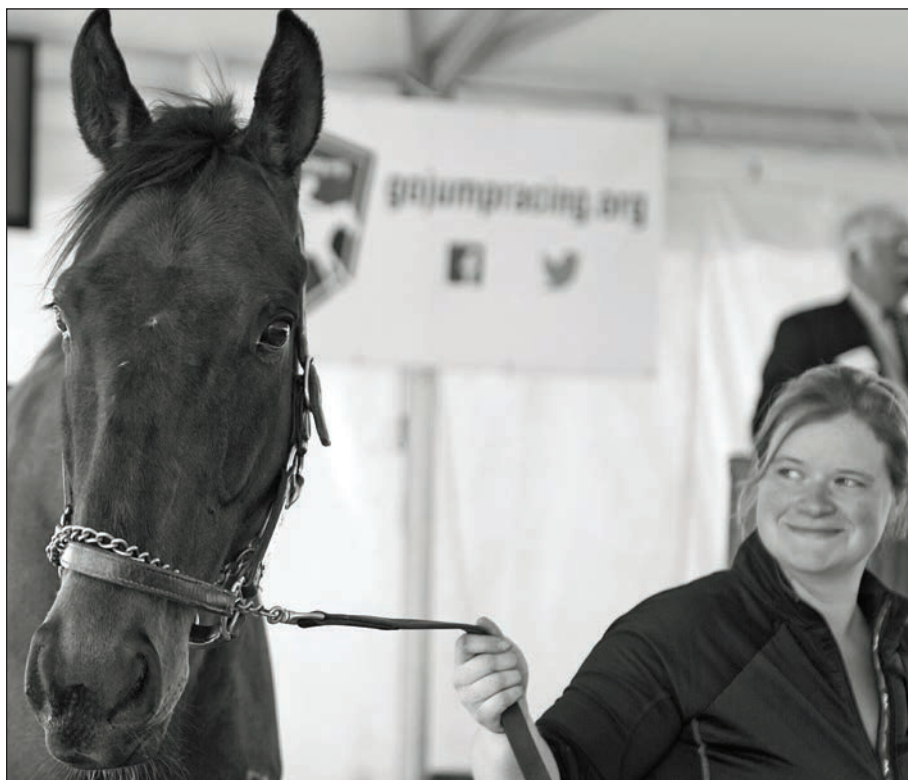
Hockey Pop was one of the horses offered for sale at last year's symposium.