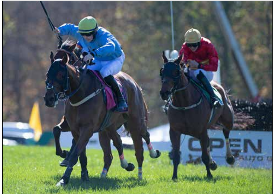
Zanzi Win, on right, takes aim on Bodes Well and Markhan (obscured) in Harry Harris.

The Harris was one of two Far Hills races that assumed new structures in 2019. The Harris had been a maiden hurdle last year, the New