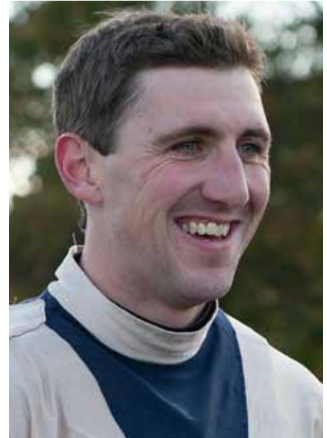
Tod Marks (2)