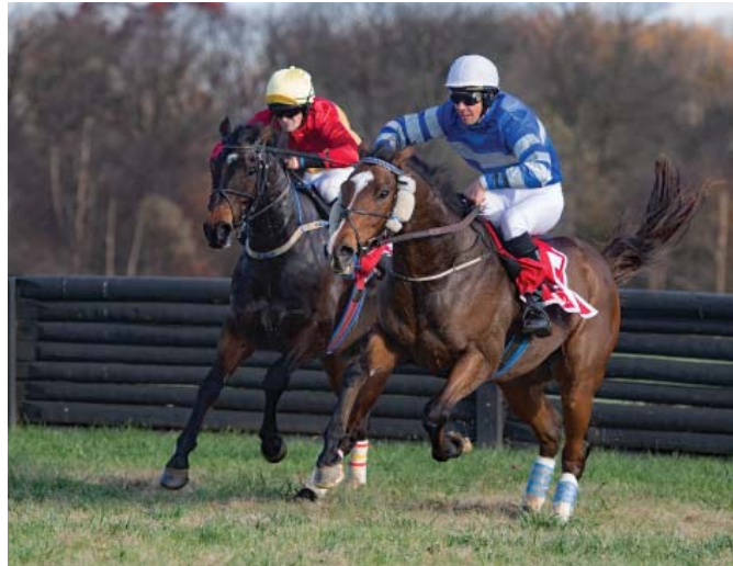
Upland Partners' Mystic Strike leads Grand Manan over last in the 2019 Pennsylvania Hunt Cup..